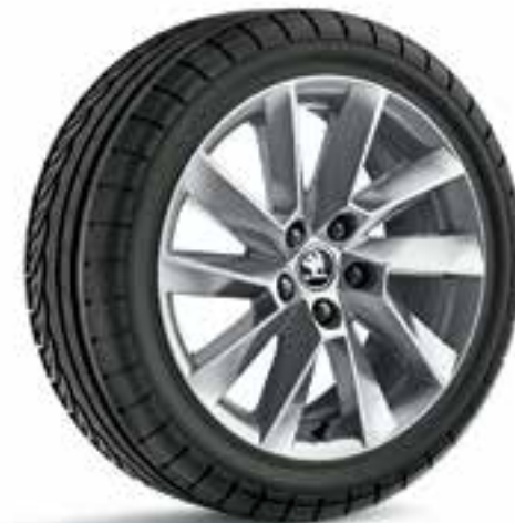
Stratos Anthracite, alloy wheels