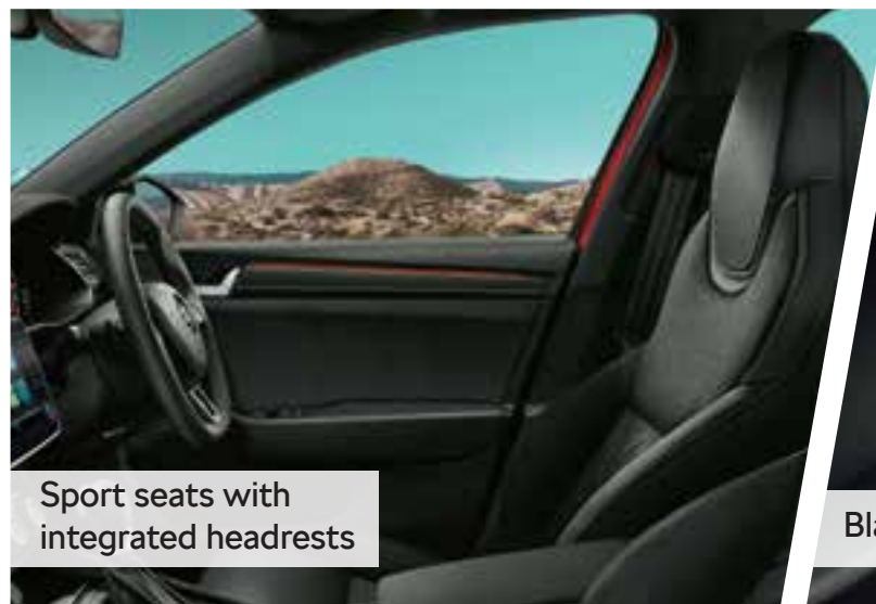
Sport seats with integrated headrests