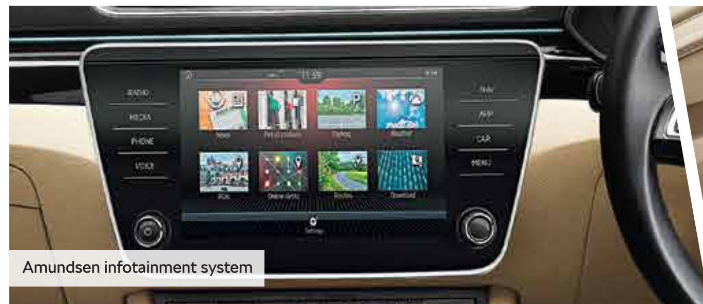
Amundsen infotainment system