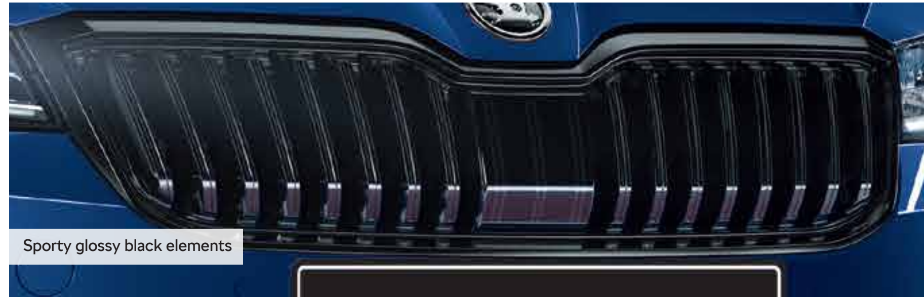
Sporty glossy black elements