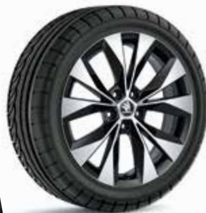
Cassiopeia dual tone, alloy wheels