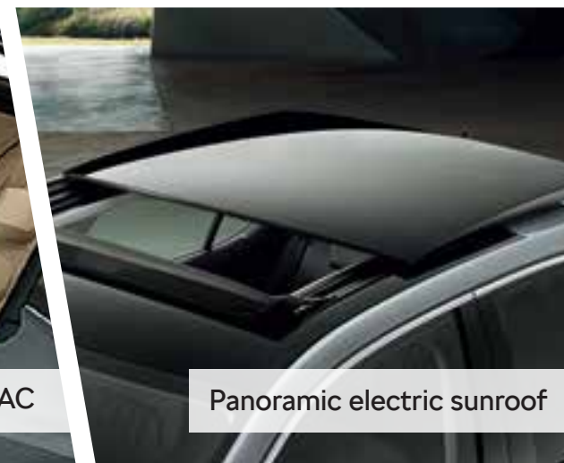
Panoramic electric sunroof