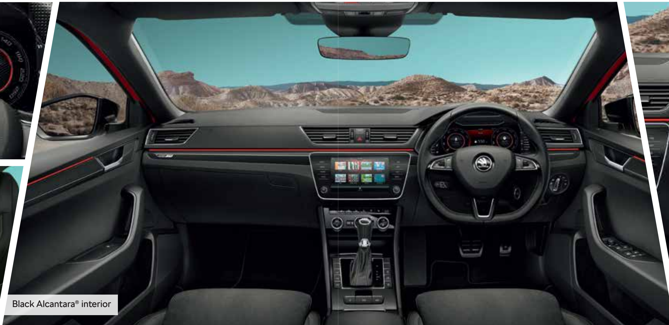
Black Alcantara® interior