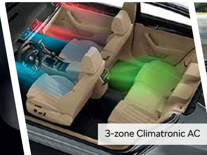
3-zone Climatronic AC