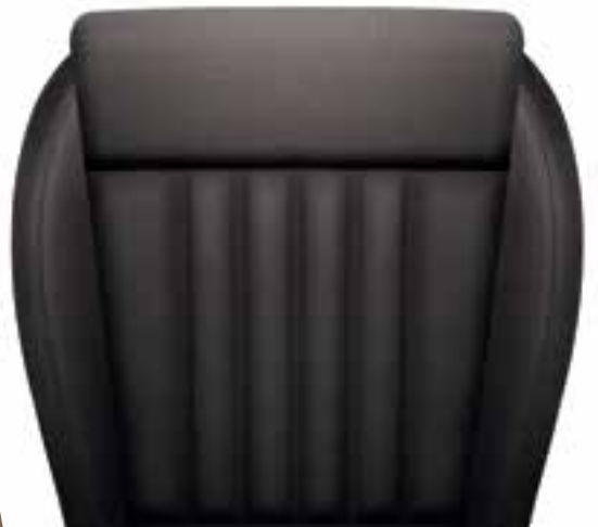
Coffee Brown perforated leather