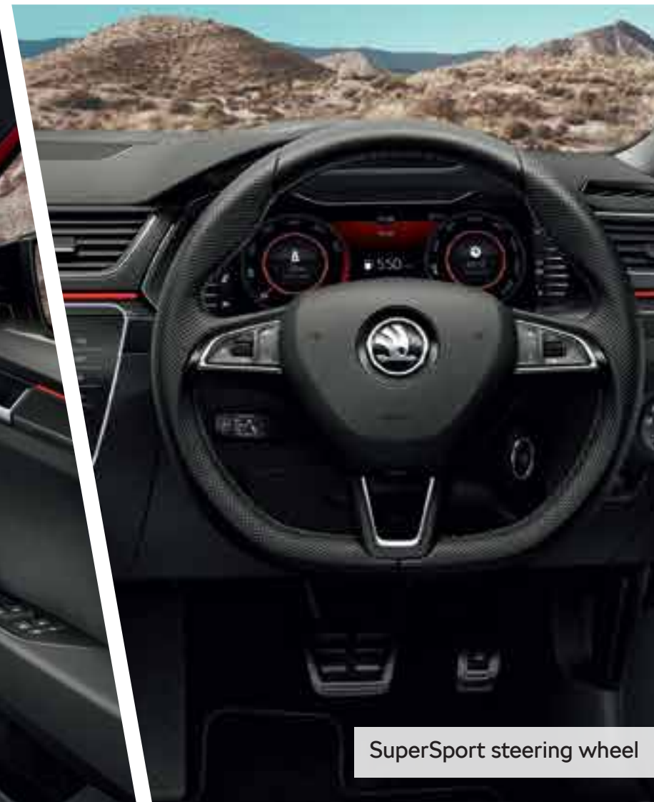
SuperSport steering wheel