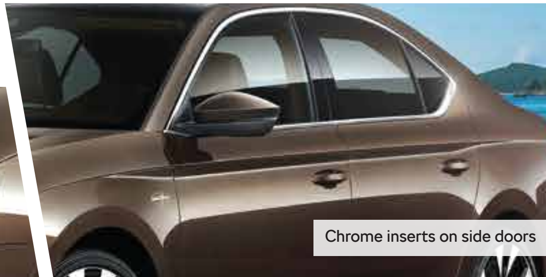
Chrome inserts on side doors