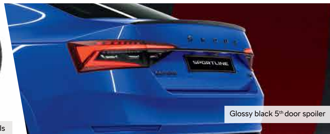
Glossy black 5 th door spoiler