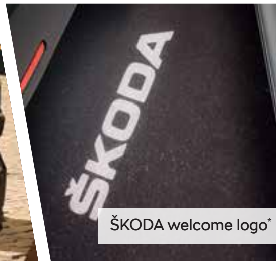
ŠKODA welcome logo*