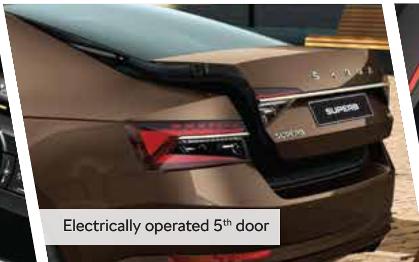
Electrically operated 5 th door