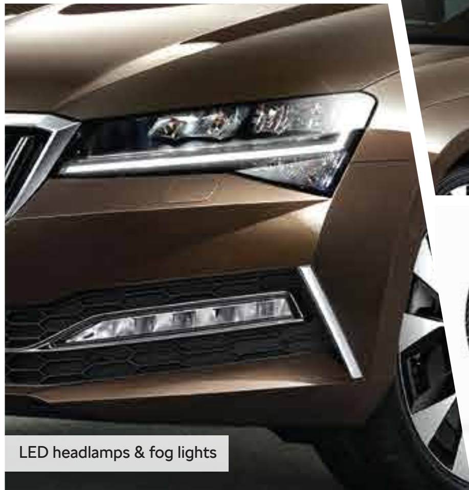
LED headlamps & fog lights