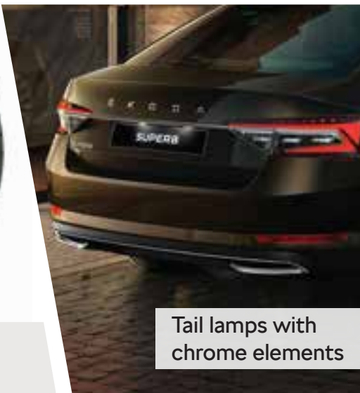
Tail lamps with chrome elements