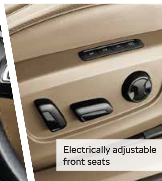
Electrically adjustable front seats