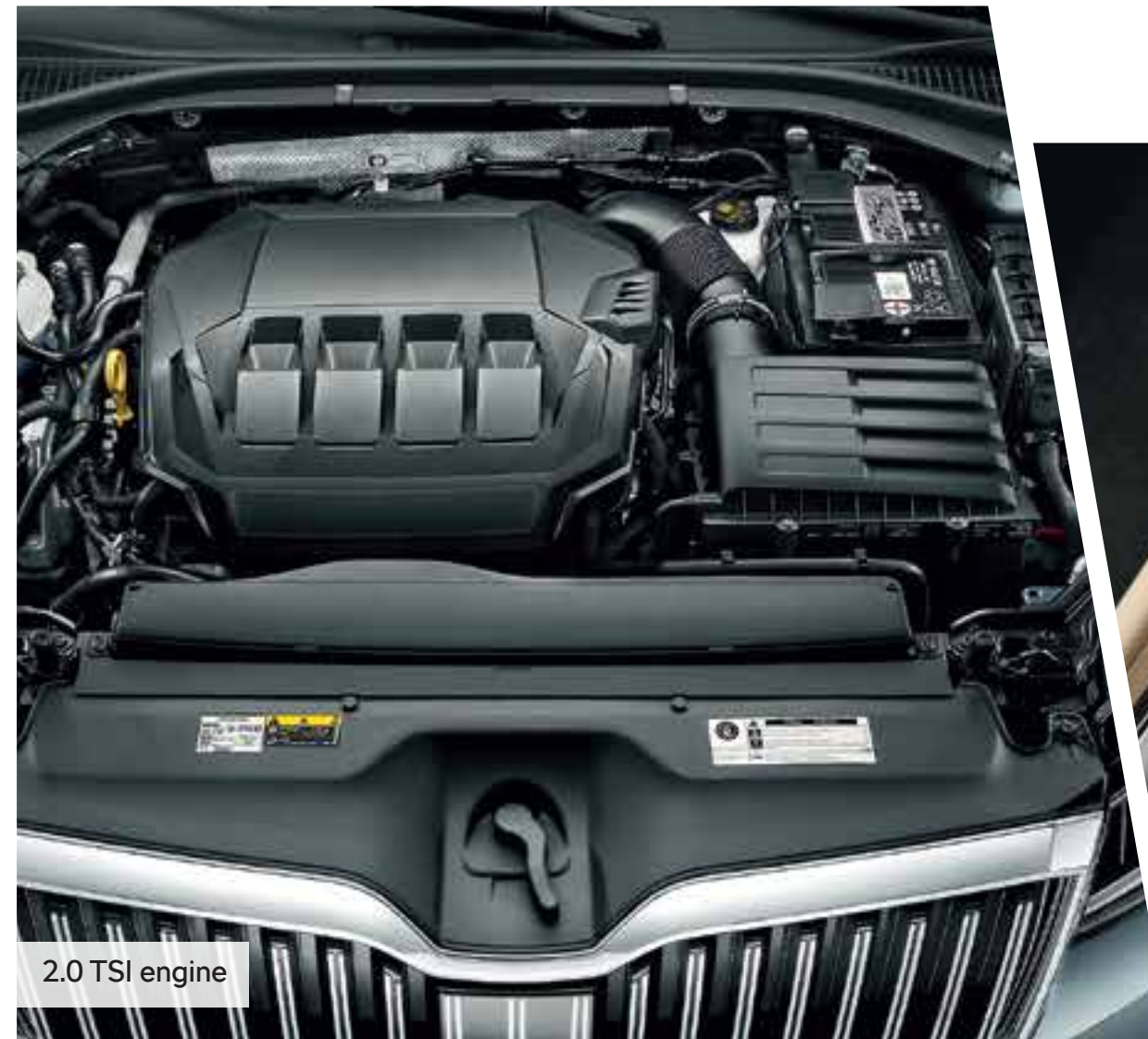
2.0 TSI engine