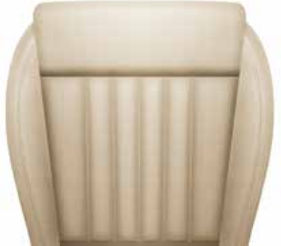
Stone Beige perforated leather