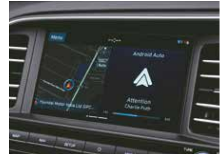
20.32 cm HD smart touchscreen infotainment