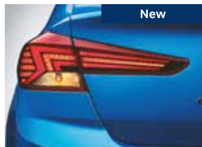
Sporty rear combination LED tail lamps