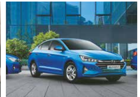
Front & rear parking sensors with rear camera