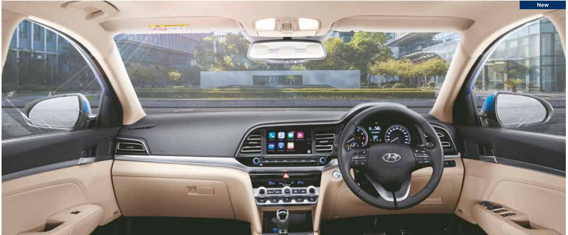
Luxurious dual tone black and beige interiors

Taking a seat in the new Elantra is like entering a world of opulence that has been created exclusively for you. It boasts of a driver-centric ergonomic design and many new additions, the centre fascia being one of them. Simply put, it is a treat to watch, to own and to drive.