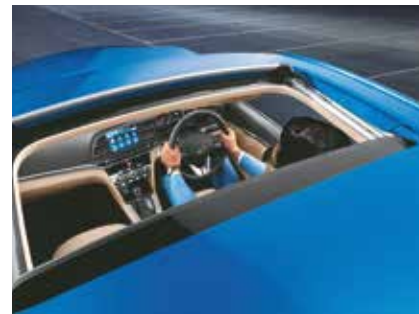
Smart electric sunroof