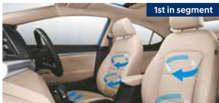
Front ventilated seats