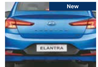
Sporty two tone rear bumper

Other features: Shark fin antenna | New front bumper design