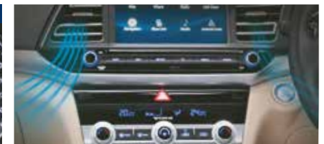
Dual zone FATC with cluster ionizer

Other features: Leather upholstery* | 10 way adjustable power driver seat with electric lumbar support | Sporty aluminium pedals | Driver-centric ergonomic design Rear centre armrest with cup holder | Rear defogger | Premium aluminium scuff plates | Sliding front centre armrest with storage Rear AC vents | Tilt and telescopic steering