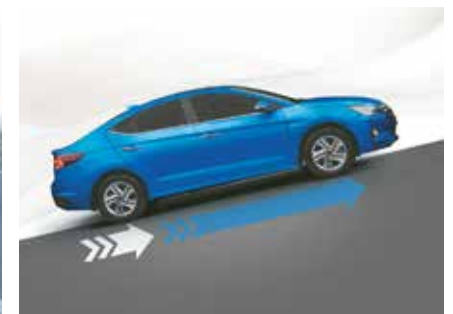
Hill assist control

Other features: Burglar alarm | Speed sensing auto door lock | Strong body structure with AHSS | Electronic stability control (ESC)