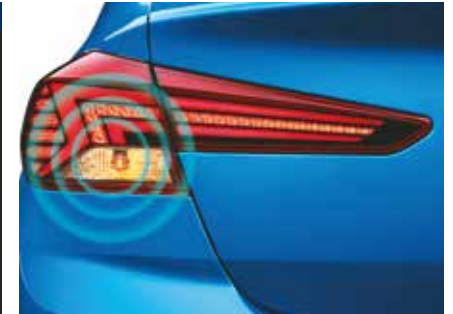
Emergency stop signal