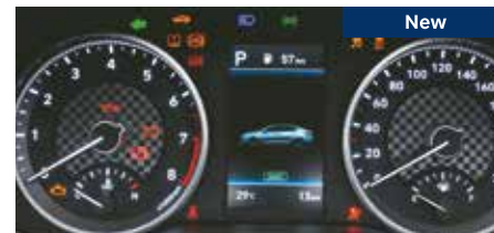
Instrument cluster with colored multi information display