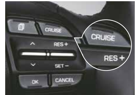
Auto cruise control