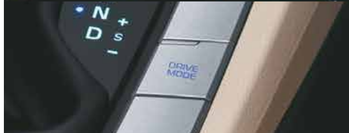
Drive mode select: normal, eco, sport & smart