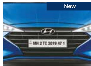
Dominant front grille design