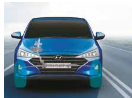
Vehicle stability management