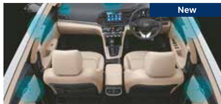
Premium infinity sound system with door speakers, centre speaker, tweeters, amplifier, sub-woofer