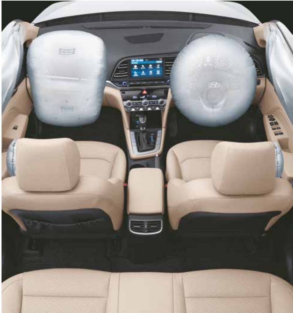
Standard six airbags