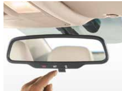
IRVM with Blue Link