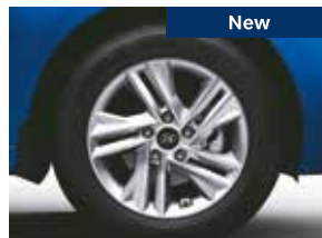
Stylish R16 alloy wheels