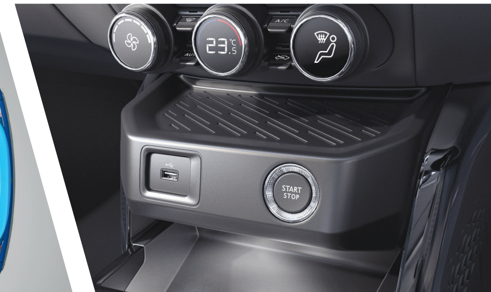
auto AC with pm2.5 clean air filter