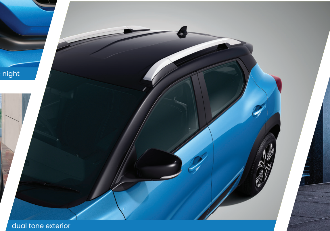
dual tone exterior