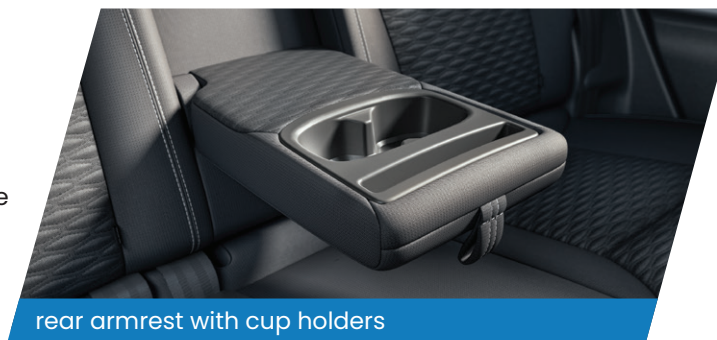
rear armrest with cup holders

The Renault KIGER's high cabin storage volume has you ready for the new, when you hit the road with your group. Get space for all your belongings with the 405L cargo space that can be enhanced to 879L by folding rear seats. There's also additional storage space of 14.9L in upper and lower glove boxes and 7.5L in the centre console storage compartment. The KIGER's rear row comes with a knee room of 222 mm, a flat floor and elbow width of 1431 mm to help comfortably seat three.