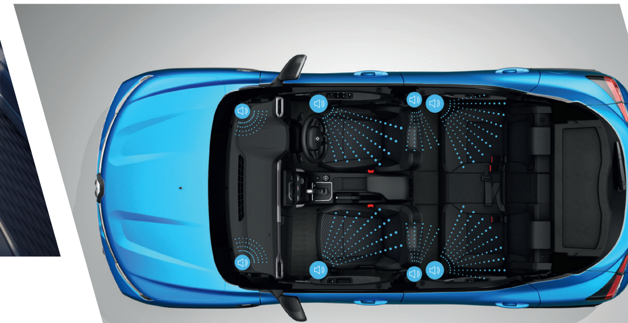
3D sound by ARKAMYS® (4 speakers + 4 tweeters)