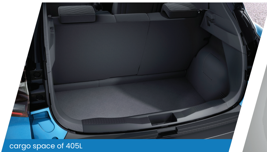
cargo space of 405L