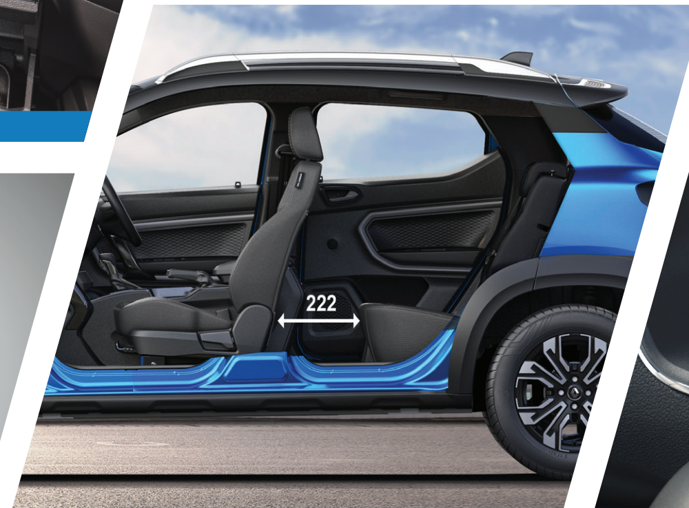
rear knee room of 222 mm