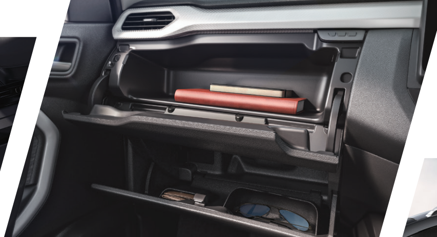
glove boxes volume of 14.9L