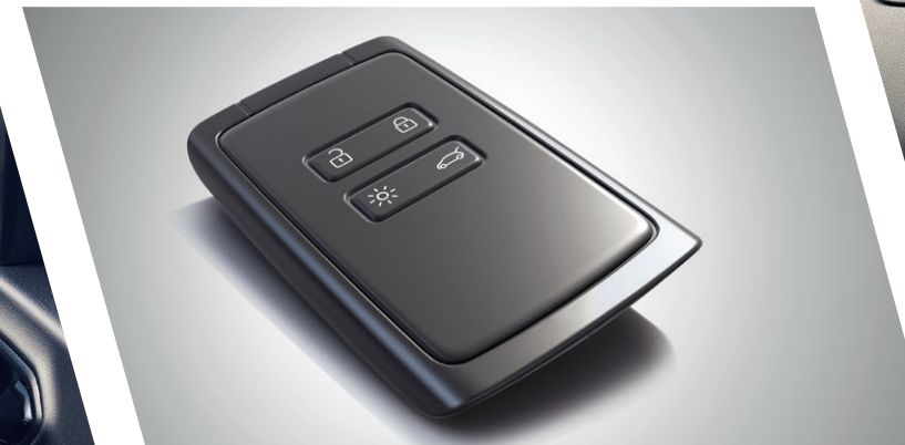
smart access card

The Renault KIGER's smart interiors are designed to make every trip memorable. It features Android Auto/Apple CarPlay with wireless smartphone replication and 3D sound by ARKAMYS® for an exciting in-car entertainment experience. Smart technology inside continues in Push Start/Stop, Smart Access Card, rear view camera and Auto AC.