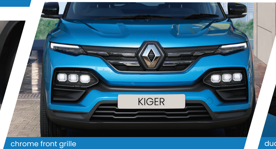
chrome front grille