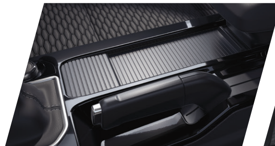
high centre console with 7.5L storage