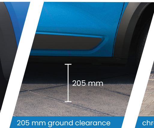
205 mm ground clearance