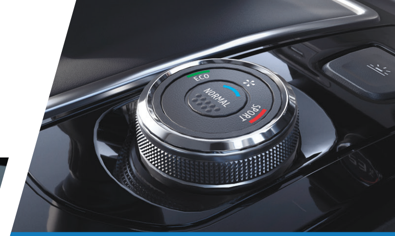
multi-sense drive modes