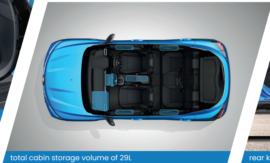
total cabin storage volume of 29L