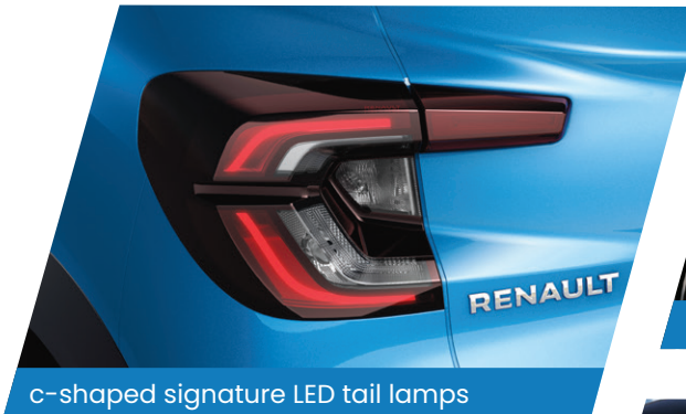
c-shaped signature LED tail lamps