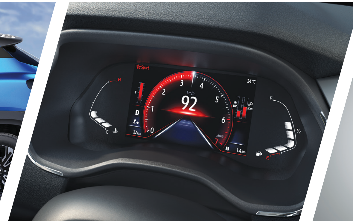
multi-skin 17.78 cm reconfigurable TFT cluster