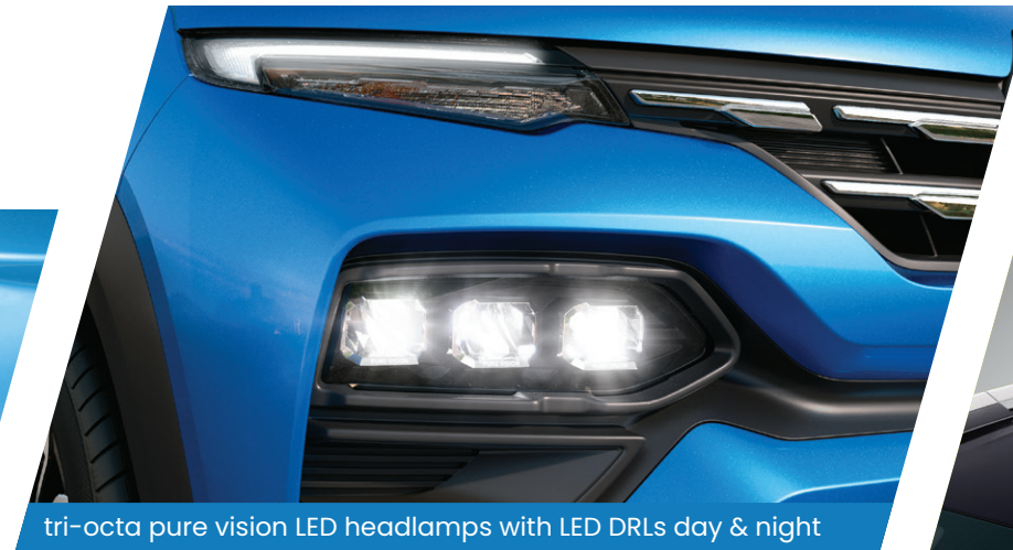
tri-octa pure vision LED headlamps with LED DRLs day & night