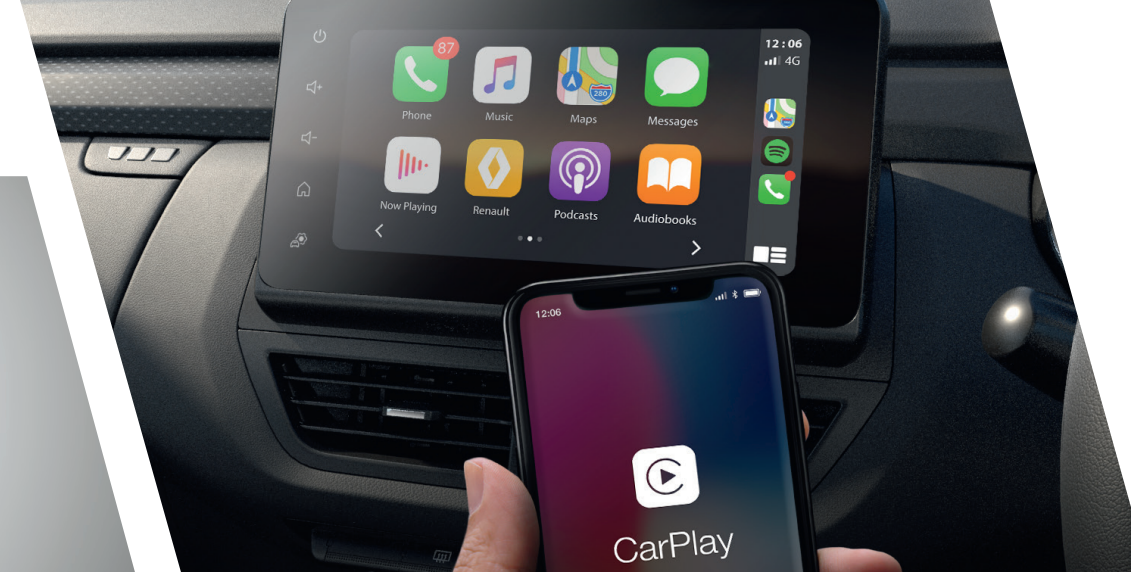
20.32 cm display link floating touchscreen with wireless smartphone replication