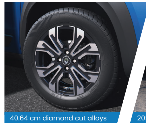
40.64 cm diamond cut alloys