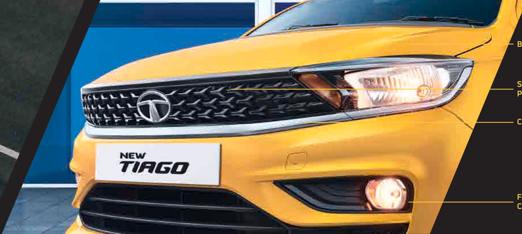
Bold Sculpted Hood Design