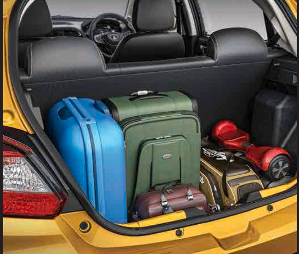
242 l Boot Space