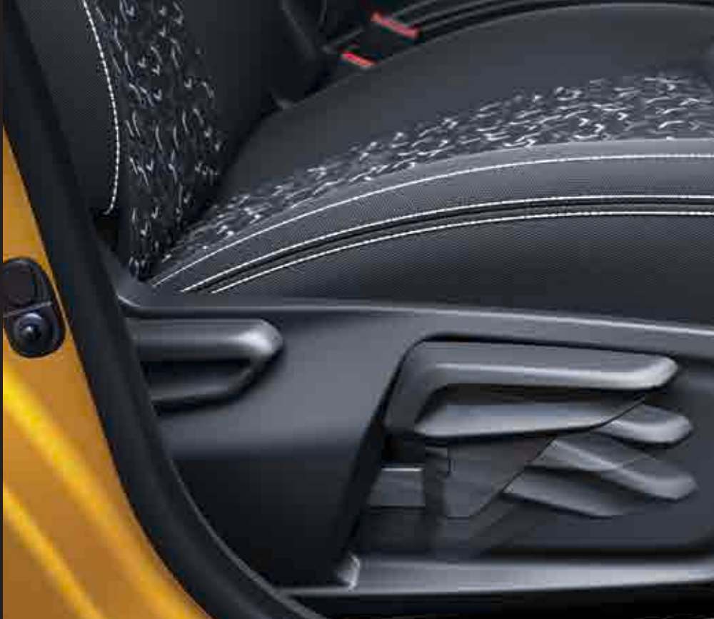
Height Adjustable Driver Seat