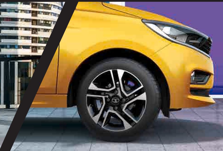
Trendy Dual Tone Alloy Wheels