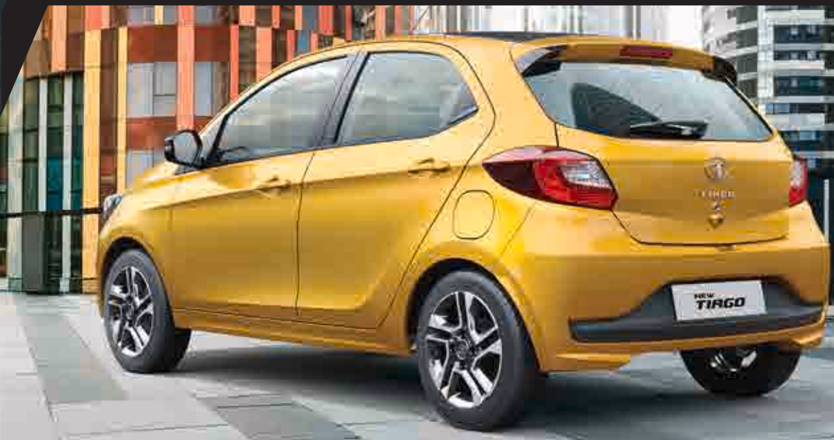
Boomerang Shaped Tail Lamps with Rear Defogger & Wiper