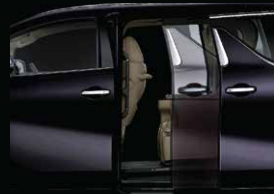
POWERED SLIDING DOORS

Unwind in your enclosed private suite crafted to luxuriate.