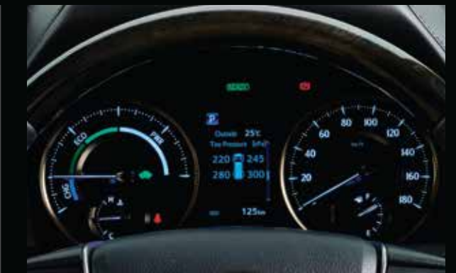
TYRE PRESSURE MONITORING SYSTEM (TPMS)

The Vellfire is uncompromisingly built with cutting-edge safety technology. VDIM: Vehicle Dynamics Integrated Management Systems, provide smooth, safe and predictable driving dynamics. It seamlessly coordinates ABS, BA, TRC & VSC proactively. Additionally equipped with 7 SRS Airbags*, Panoramic View Monitor and Tyre Pressure Monitoring System, the Vellfire, ensures ultimate safety while you forge ahead.