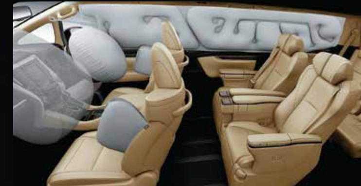
7 SRS AIRBAGS*

INTUITIVELY SAFE, EXQUISITELY COMFORTABLE.