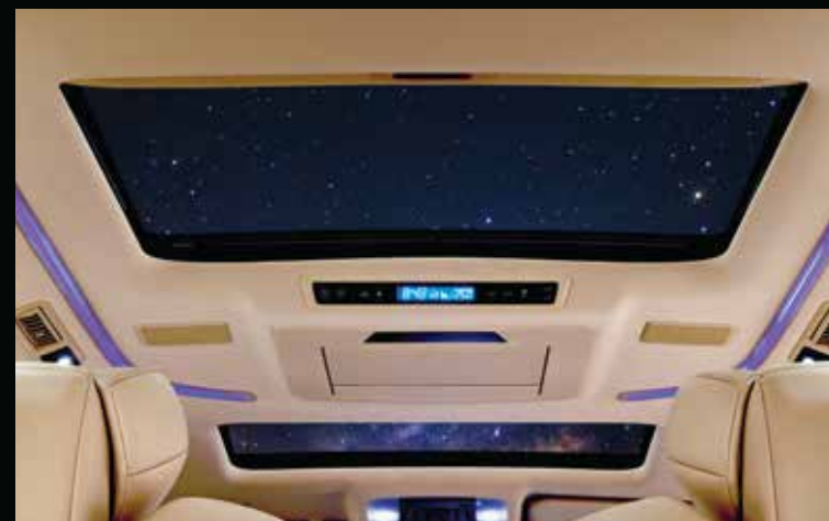
MESMERIZING DUAL SUNROOF