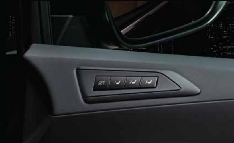
POWERED SEATS WITH MEMORY FUNCTION