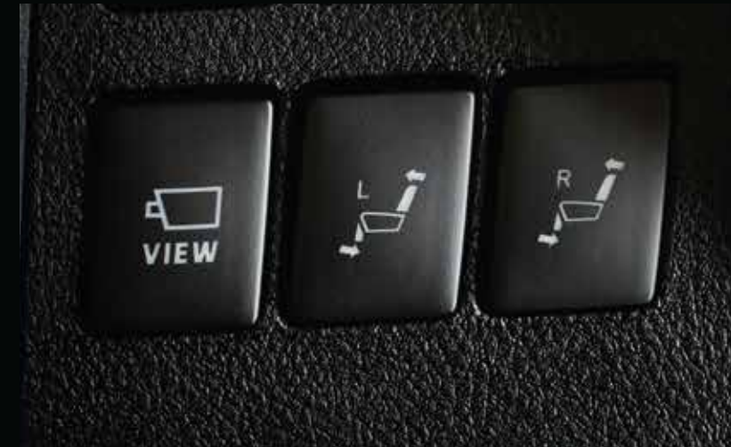
ONE TOUCH CONTROLS FOR PANORAMIC VIEW & SEATS