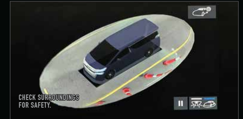
PANORAMIC VIEW MONITOR