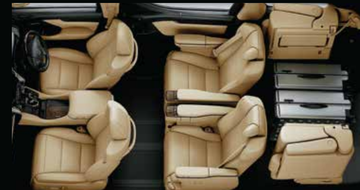
SUITE ON THE GO