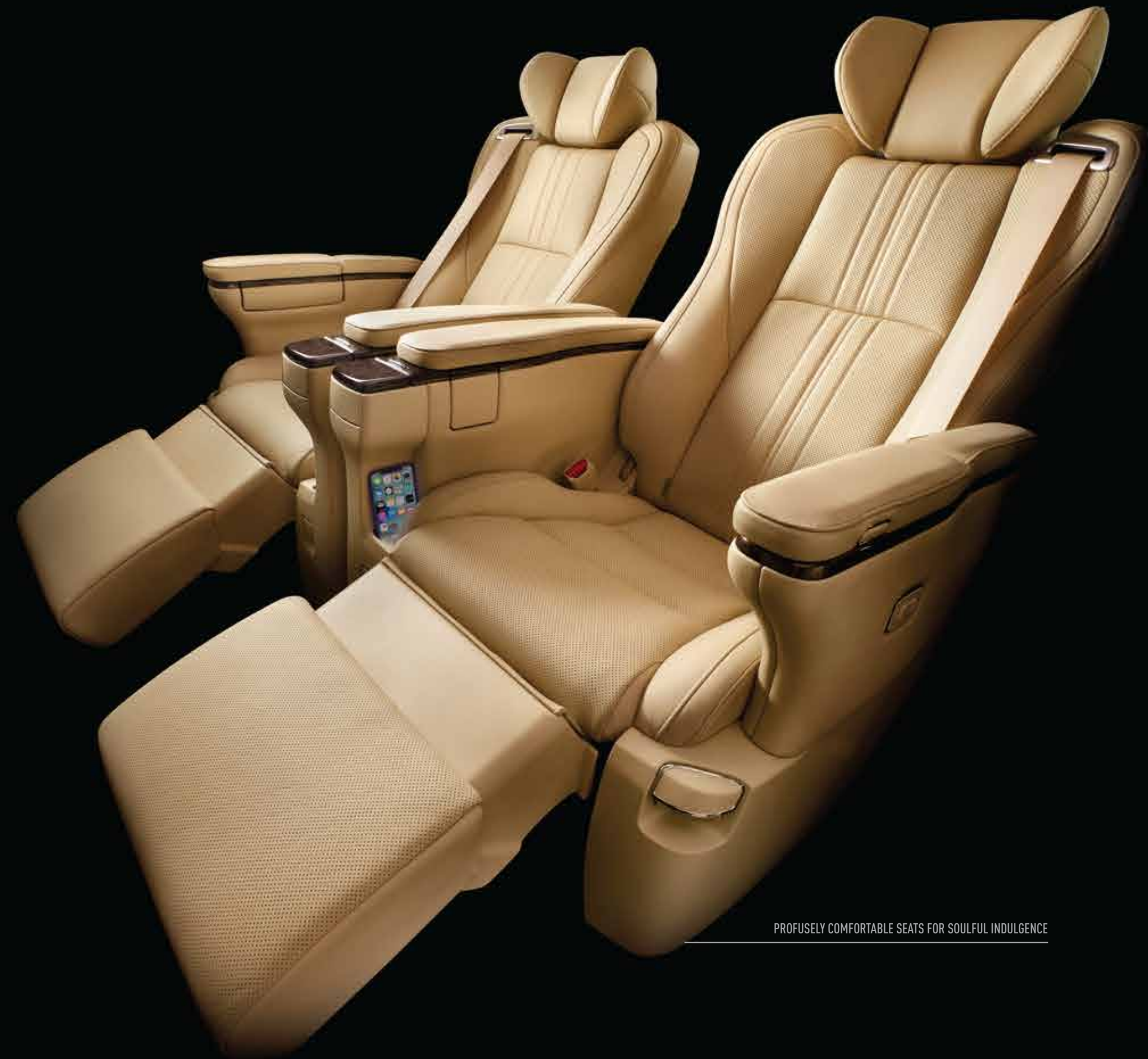
PROFUSELY COMFORTABLE SEATS FOR SOULFUL INDULGENCE