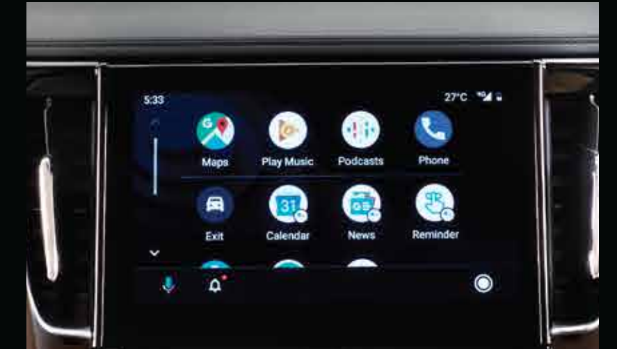
APPLE CARPLAY & ANDROID AUTO, SMARTDEVICELINK