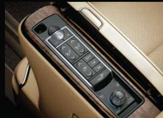
LOUNGE COMMAND CENTRE