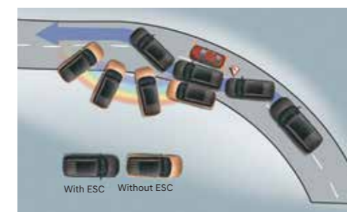
Electronic stability control (ESC)