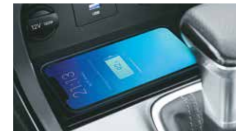
1 st & 2 nd row smartphone wireless charger