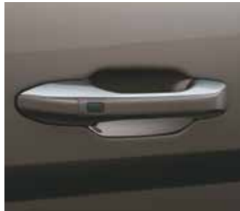
Dark chrome exterior finish outside door handles

Other features: LED positioning lamps | Crescent glow LED DRLs | Trio beam LED headlamps Dark chrome exterior signature cascading grille | LED fog lamps