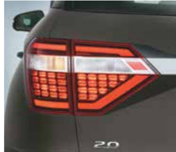
Honey-comb inspired LED tail lamps