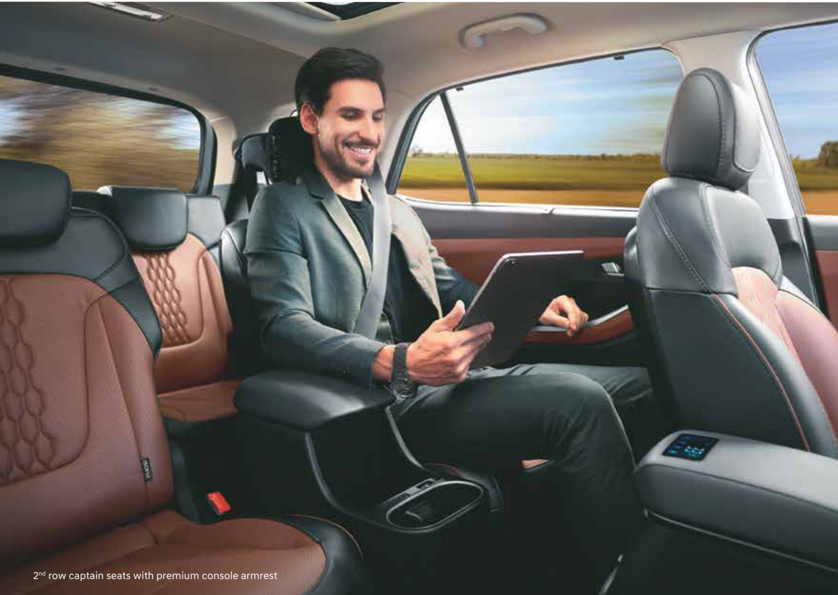
2 nd row captain seats with premium console armrest

Adore your private palatial retreat on wheels wherever the journey takes you.