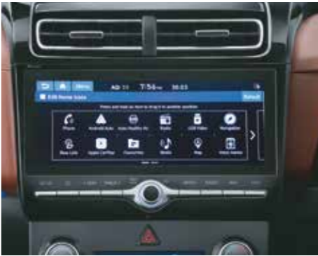
26.03 cm (10.25") HD touchscreen system