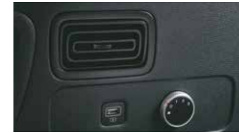
3 rd row AC vents with speed control (3-stage)