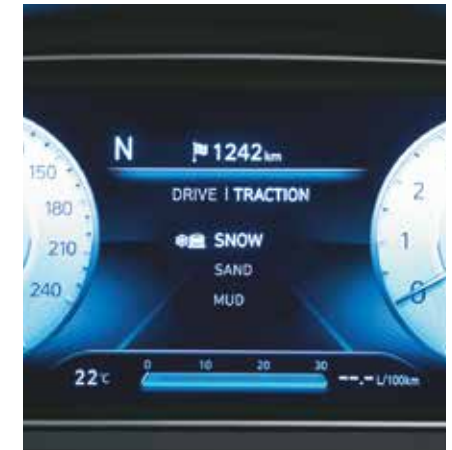
Traction control modes