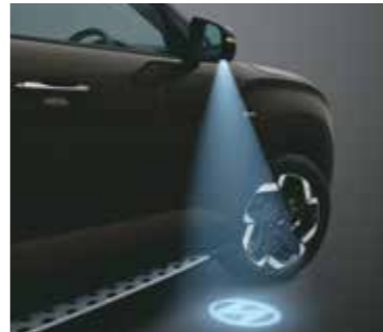
Puddle lamps with Hyundai logo projection