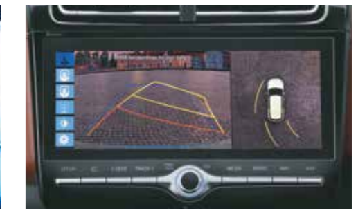
Surround view monitor (SVM)