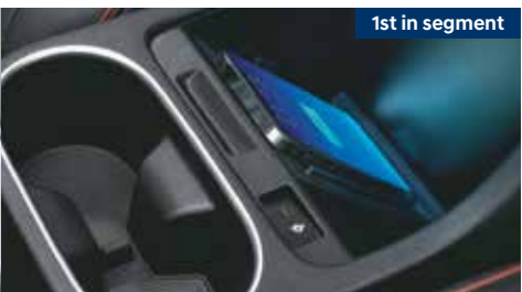
1 st in segment