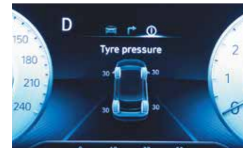
Tyre pressure monitoring system (Highline)