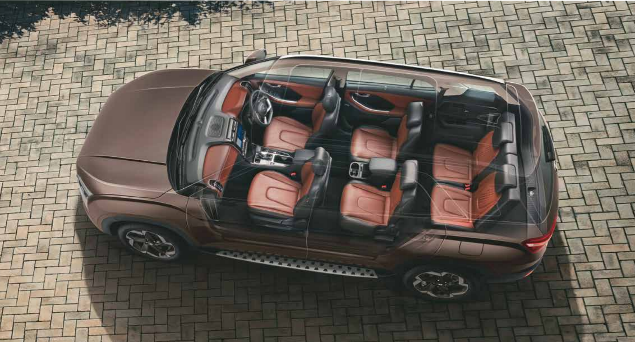
Leather pack: Perforated D-cut steering wheel | Perforated gear knob | Cognac brown and black seat upholstery | Door armrest

The interior of the Hyundai ALCAZAR immerses you in uncluttered design. Complete with premium dual tone cognac brown interiors, the 64 colours ambient lighting offers a regal touch to the cabin. Carefully selected materials accentuate the aesthetic, complete with Hyundai ALCAZAR's advanced technology, ensuring that your entertainment knows no bounds. Experience serenity thanks to a voice controlled panoramic sunroof and an auto healthy air purifier. The tranquil sanctuary is also outfitted with an HD touchscreen system with powerful Bose premium sound system, immersing you in a rich and balanced premium audio experience.