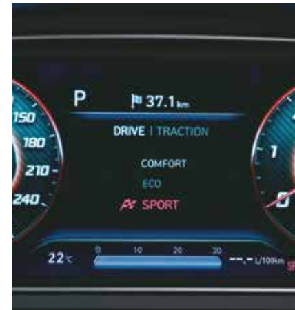
Drive mode select