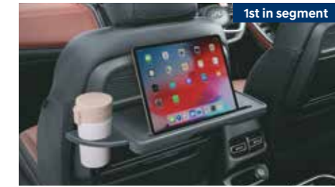
1 st in segment Front row seatback table with retractable cup-holder and IT device holder