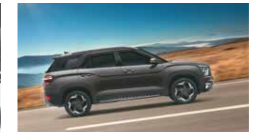
Hill start assist control (HAC)