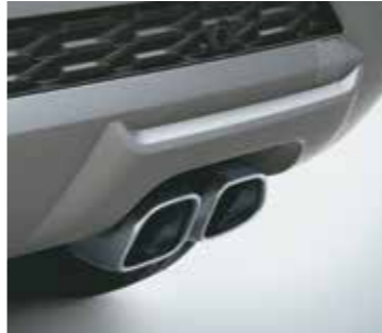
Twin tip exhaust