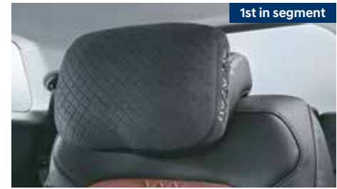
1 st in segment 2 nd row headrest cushion