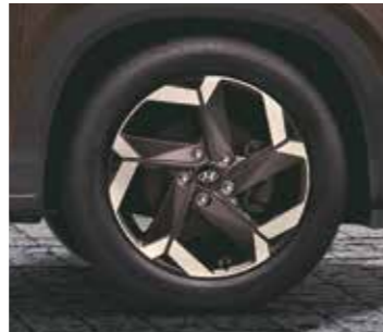
R18 (D=462 mm) diamond cut alloys