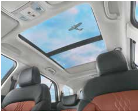
Voice enabled smart panoramic sunroof