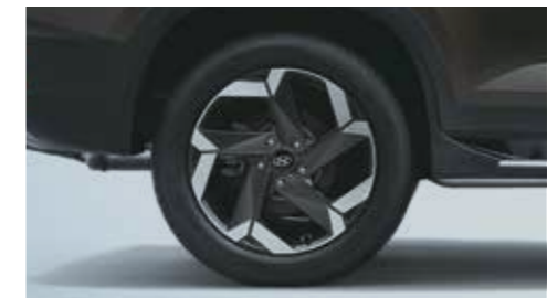
Rear disc brakes