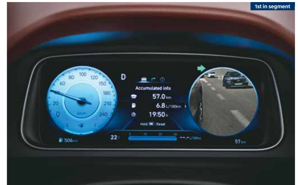
Blind view monitor (BVM)

Each element of the Hyundai ALCAZAR has been designed to provide excellence, in comfort and in safety. Complete with highly accurate front & rear parking sensors and state-of-the-art security alerts like speed alert system, you're always one step ahead of unexpected events on the road. Each journey in the Hyundai ALCAZAR inspires awe and admiration as it carries passengers in uncompromised safety.