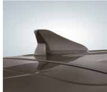
Shark fin antenna