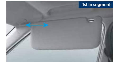
1 st in segment Front row sliding sunvisor