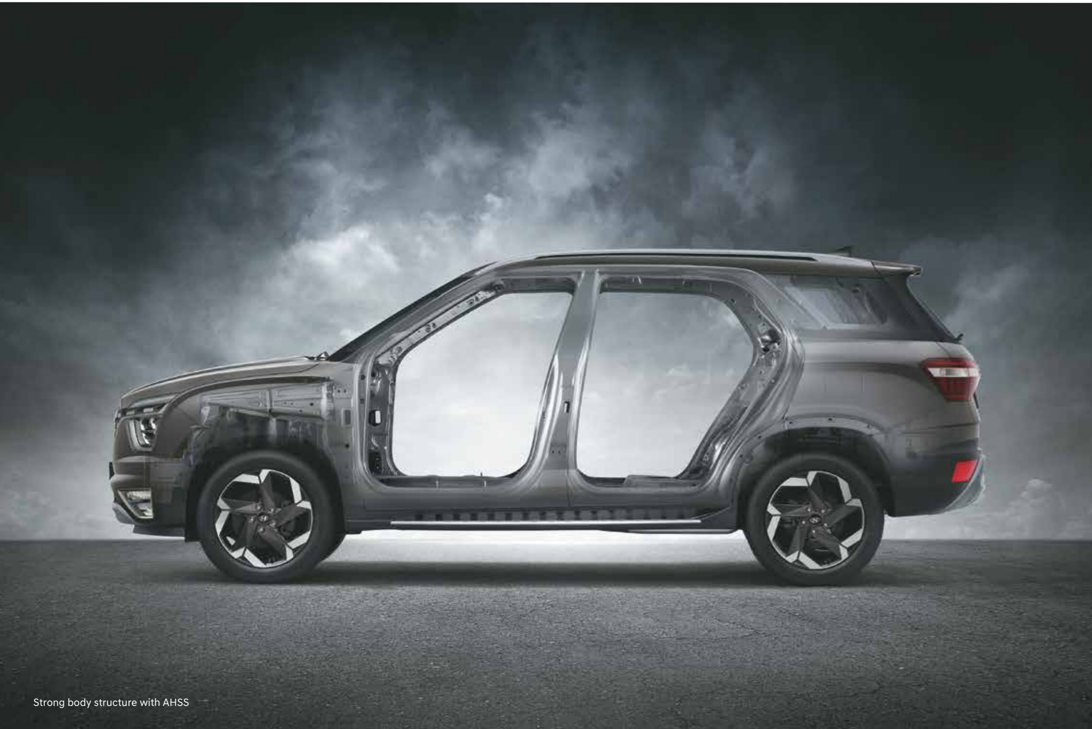
Strong body structure with AHSS