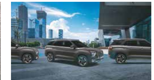
Parking assist: Front and rear parking sensors

Other features: Emergency stop signal | Speed alert system | Speed sensing auto door lock | Driver rear view monitor Impact sensing auto door unlock | Child seat anchor (ISOFIX) | Electric parking brake with auto hold