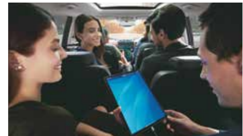
4 USB chargers for 3 rows